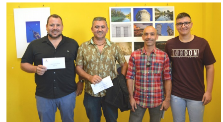
Premiats del ralli

On the following day, el I Ral-li fotogràfic #Beniarbeig" managed to transfer to Beniarbeig 30 photographers from around the region, who had 14 hours to try to capture the best photographs related to the river, local architecture, night and a free theme.