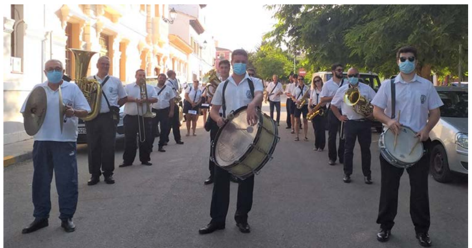
Start of the street procession from Calle Escoles

Jaume I and the avenida de la Pau, roads which are not part of the usual route. The aim of the Unió Musical Beniarbeig was to bring music to as much of the village as possible, something which they think was achieved if you consider the large number of people of all ages who applauded the passing of the band from their doorways, windows and balconies.